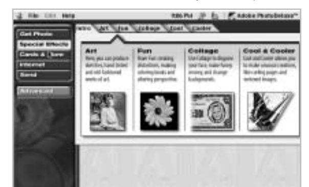
Special Effects Screen

For the first timer playing with photo manipulation and for the easy price of $49, I think it will be good for the average user.