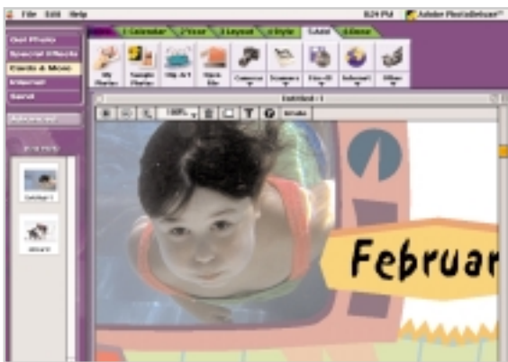
Creating a Calendar

If you work with graphics, you already know that Adobe Photoshop is a powerhouse program that can do anything you have enough RAM for. The downside is you need substantial support materials to begin to use it. (I have a Photoshop book that's 3-inches thick.)