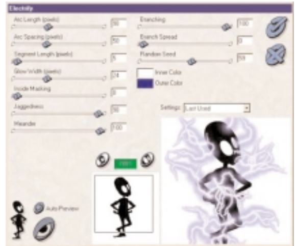
Screenshot of Zenofex.

At $120 on average for these programs, they aren't cheap, but if you need them, it's a bargain. You'll easily save that much money EACH time you use your filters. I will say that if your going to buy just one of the many programs out there of this type - buy Eye Candy, if your going to buy two, buy Zenofex, with these two outstanding plug-in programs, the world of "Cool" is at your fingertips.