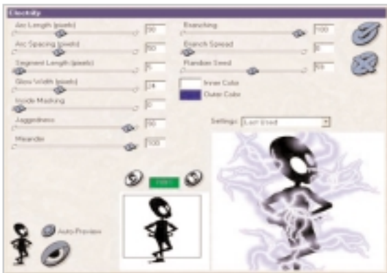
Screenshot of Xenofex.

At $120 on average for these programs, they aren't cheap, but if you need them, it's a bargain. You'll easily save that much money EACH time you use your filters. I will say that if your going to buy just one of the many programs out there of this type - buy Eye Candy, if your going to buy two, buy Xenofex, with these two outstanding plug-in programs, the world of "Cool" is at your fingertips.