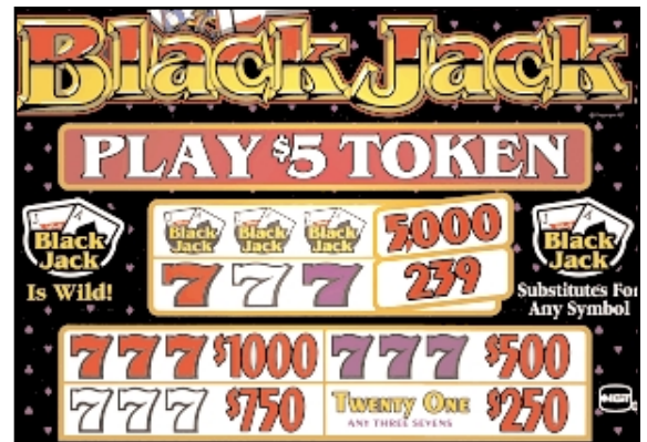
BlackJack Slot Machine